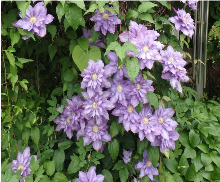
Opposite: Trees and shrubs bring diverse textures and colors to the Kraft garden. Top: One of many Arisaema fargesii that "jump around the garden." Bottom: A clematis in full bloom.