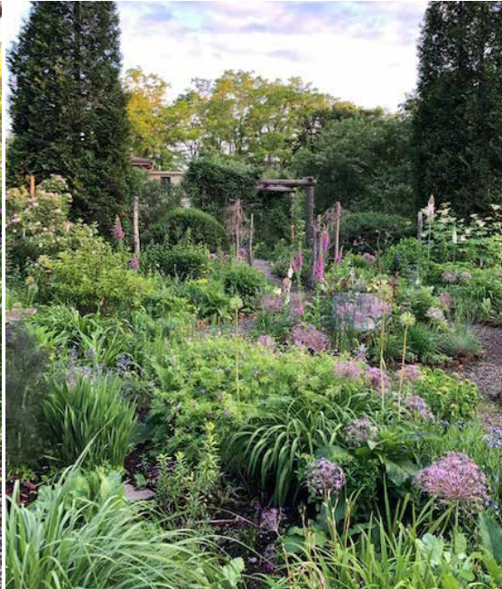
Top: Backyard patio and pond in the woodland garden. Bottom left: Alliums bloom under the arbor. Bottom right: The perennial garden in June.