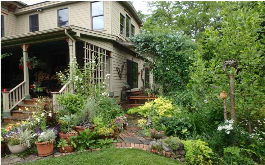
Garden outside the back porch and deck.

And why has he named his place Pagodahill? The property is named for the Pagoda dogwood, Cornus alternifolia , an Eastern North American native, that proliferate on this hilltop bit-of-paradise.