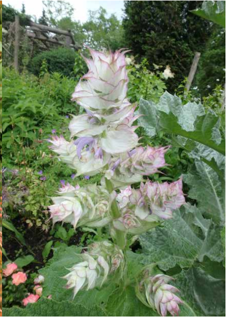
Top: Magnolia sieboldii. Bottom left: Lonicera x tellmanniana. Bottom right: Salvia sclarea.