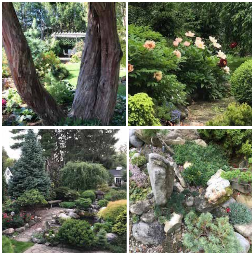
Scenes from the Bordonni garden, including a massive yew (top left), peonies (top right), conifers large and small (bottom left) and a rock garden (bottom right.)

What she has created is a harmonious landscape of green. “If you only have a green palette, you start noticing the many shades of green.” But what you also notice about her garden is how she is so effective at layering, varying textures, and utilizing spaces big and small. Choice perennials and Japanese maples introduce color. Right plant, right place is her mantra.