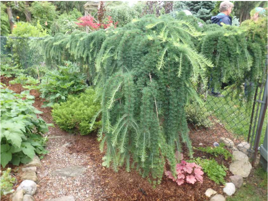
Top: The lily pond in the Bordoni garden. Bottom: Larix decidua 'Pendula' trained to grow along the fence.