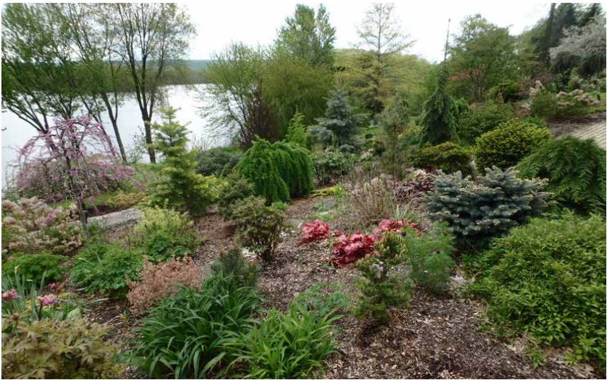
The Kraft garden is graced with views of Crooked Lake.